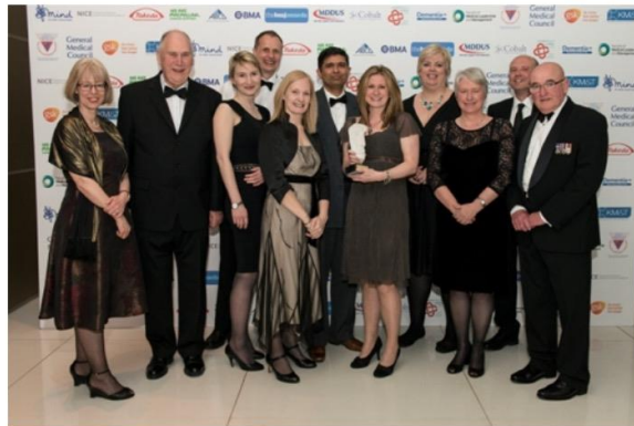
Dementia Team of the Year - sponsored by Dementia UK Torbay and South Devon DCH Learning Community, Devon Partnership Trust