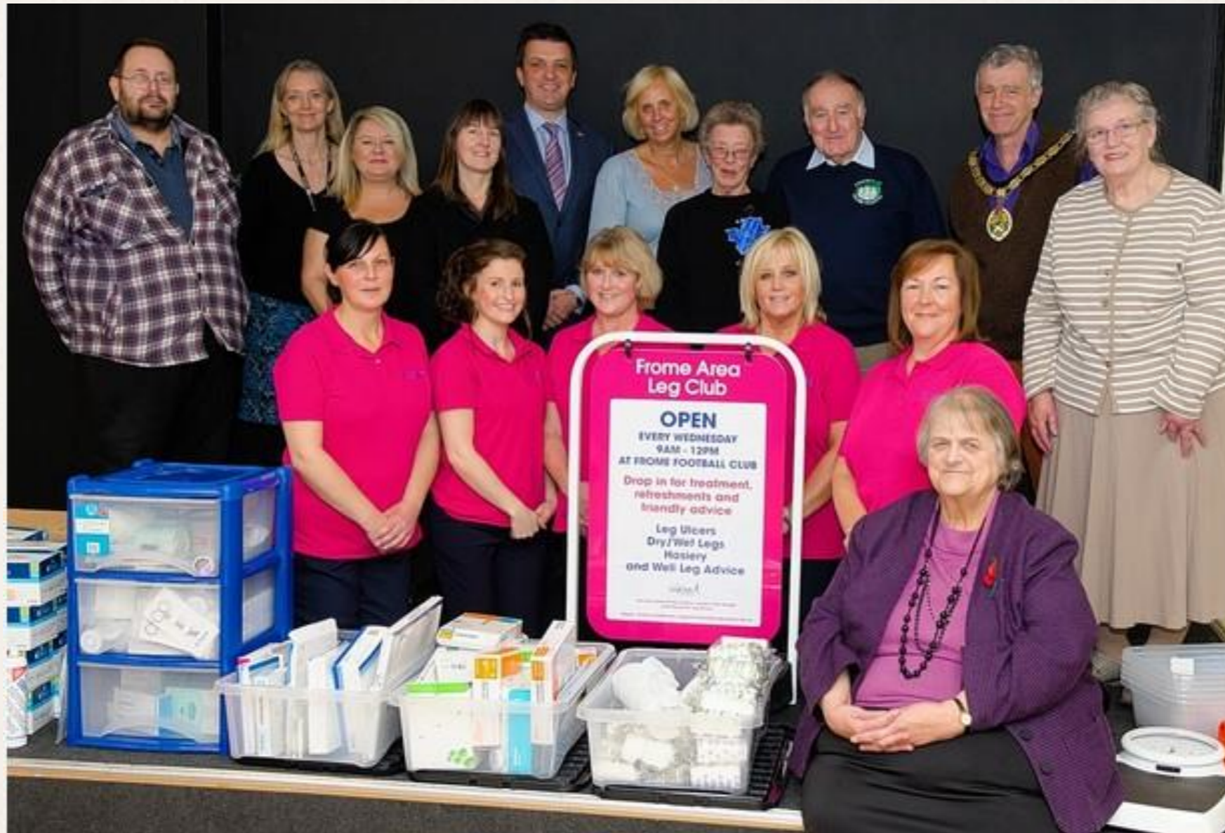
Frome Leg Club